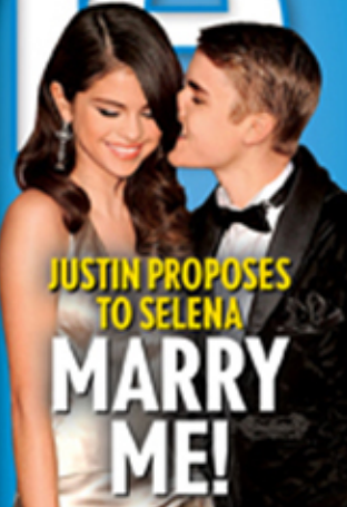
JUSTIN PROPOSES TO SELENA MARRY ME!