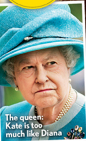
The queen: Kate is too much like Diana