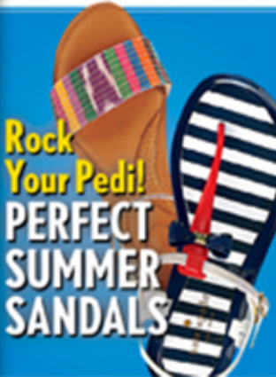
Rock Your Pedi! PERFECT SUMMER SANDALS