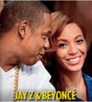
JAY Z & BEYONCÉ