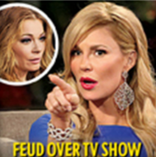
FEUD OVER TV SHOW